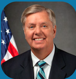
Senator Lindsay Graham (R-SC)

"Working to support U.S. ally and partner health security capacity directly promotes global stability, builds and maintains key partnerships, and promotes the readiness and interoperability of DOD personnel and our allies and partners."