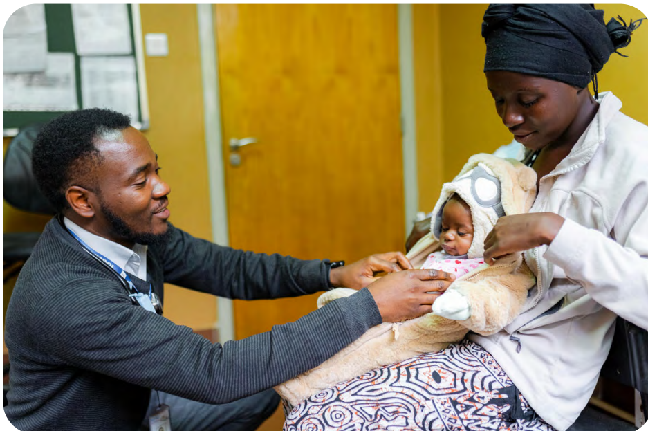
A mother with her baby at the Baylor College of Medicine Children's Foundation, a Global Fund partner in Malawi.

mosquito nets distributed to protect families from malaria