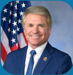
Representative Michael McCaul (R-TX)

Polling from the Reagan Institute shows that a bipartisan majority of Americans think U.S. global leadership is beneficial to both the United States and the world.