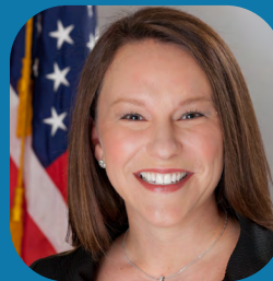
Former Representative Martha Roby (R-AL)

"Most people want to make sure their tax dollars go to a good cause. Once you understand what the Global Fund has done, and can do and will do, most critics kind of melt away. The proof is in the pudding. The numbers speak for themselves. This has been one of the most successful programs in the history of government."